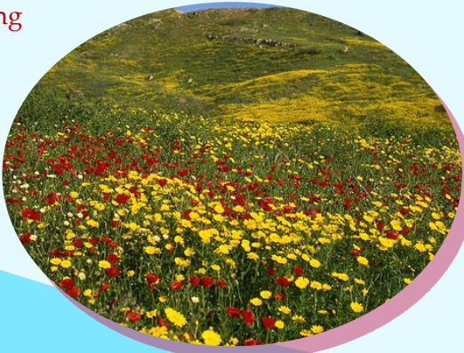
Galilee in the spring